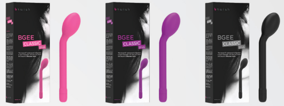
BSCGP0873 Powder Pink

B Swish takes pleasure to the next level with the Bgee Classic Plus. With a perfectly curved broad head, silky body-safe materials and 5 rumbly functions, this 8" waterproof massager will have you begging for more.