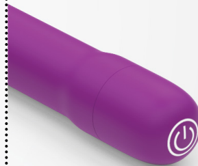
SIMPLE BACKLIT PUSH-BUTTON

The 5-functions are cycled through the click of a single button, which is lit up by a white light for easy play in the dark.